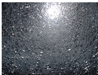
Add lighting panel