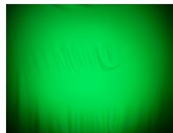
Coverage more then doubled.